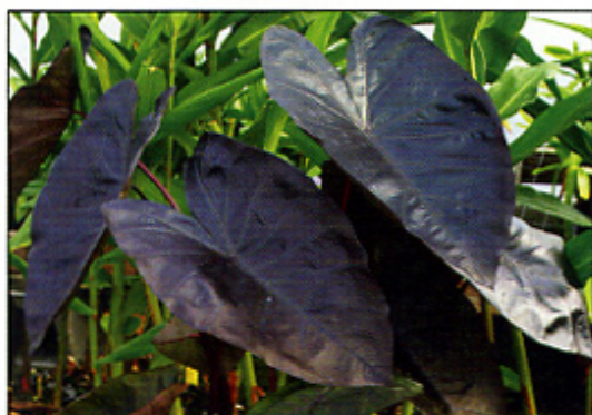
'Diamond Head' grows up to 60 inches high.

Plants do best in full sun to light shade and moist soil. They are hardy to USDA Hardiness Zones 7b-11. Frost will trigger dormancy.